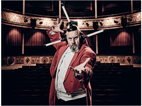
The Great Baldini

The Great Baldini: Family Magic Show Sun 27 • 3 - 4pm • £8/children £6 The legendary magician tells the story of his (and Baldwin the dog's) life from his first trick to the height of their careers – attempting Houdini's greatest escape. A show packed with magic, puppetry and escapology. Recommended for age 4+