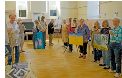
Brushes with Biscuits artists

Join us for a preview of this weekend's exhibition.