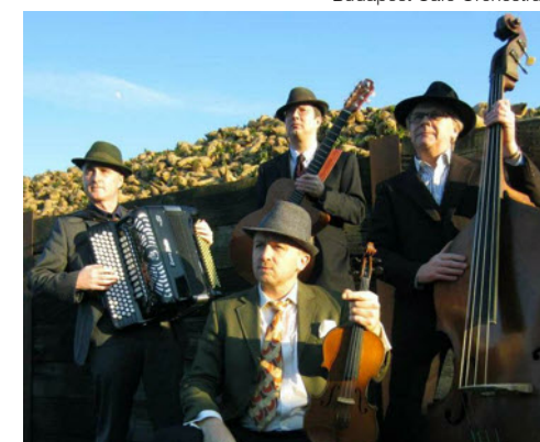
Budapest Café Orchestra

Sat 16 & Sun 17 • 10am - 4pm Back by popular demand: our exhibition of postcard-sized (6"x4") artworks created and then donated by local people. Work can be in any medium, on any subject, and anyone can enter. Entries to 14 Cotswold Gardens, Wotton-under-Edge, GL12 7HW. Then come along to the exhibition and bid to see if you can own a masterpiece by a local artist! All proceeds will go to Under the Edge Arts.